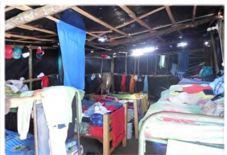
Mens dormitory at the Center