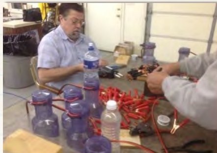
Solder, solder, solder..