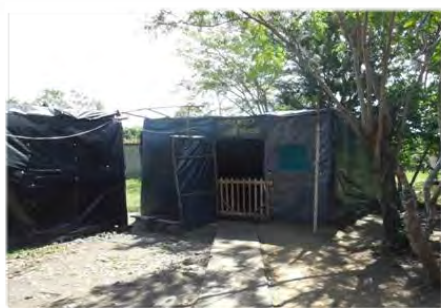
Medical clinic in center and dormitory on the left