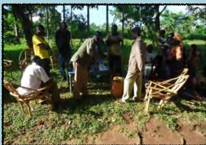
Demonstrating how to use the Chlorine Producing Unit (CPU).