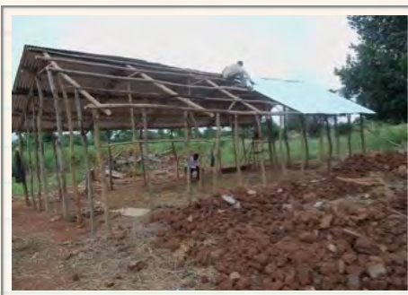
Church under construction