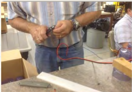
Stripping wire for end clips