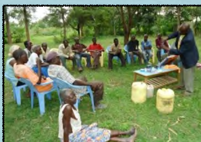
This community has been battling typhoid and has at least one death recently of typhoid.