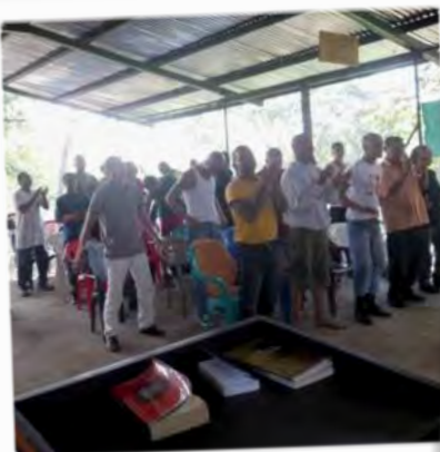
Praise and Worship time