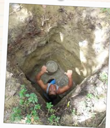
Digging a latrine