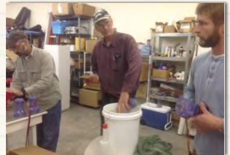
CPUs are tested for leaks and proper operation before they are distributed.