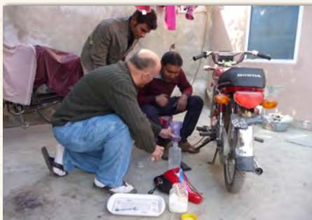
A CPU being demonstrated in Pakistan. It is powered by the motorcycle battery.