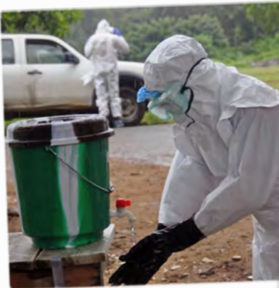
Chlorine being used to disinfect