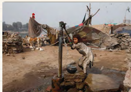
A source of drinking water in Pakistan