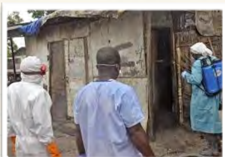
Worker wait as chlorine solution is applied to a patients home