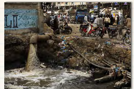
The gutters in the area are overflowing with sewage while the authorities turn a deaf ear to the problem.